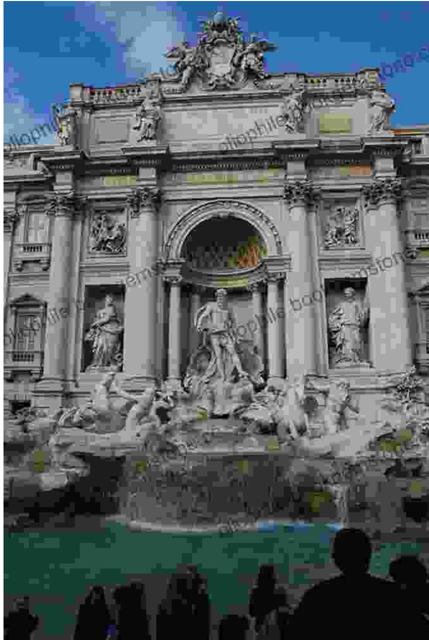
Trevi Fountain, one of Bernini's most famous masterpieces

Bernini was a consummate showman, whose works were characterized by their dramatic flair and emotional impact. His sculptures, such as the Ecstasy of Saint Teresa and the Rape of Proserpina, captured the essence of human emotion and movement with unparalleled realism and intensity.