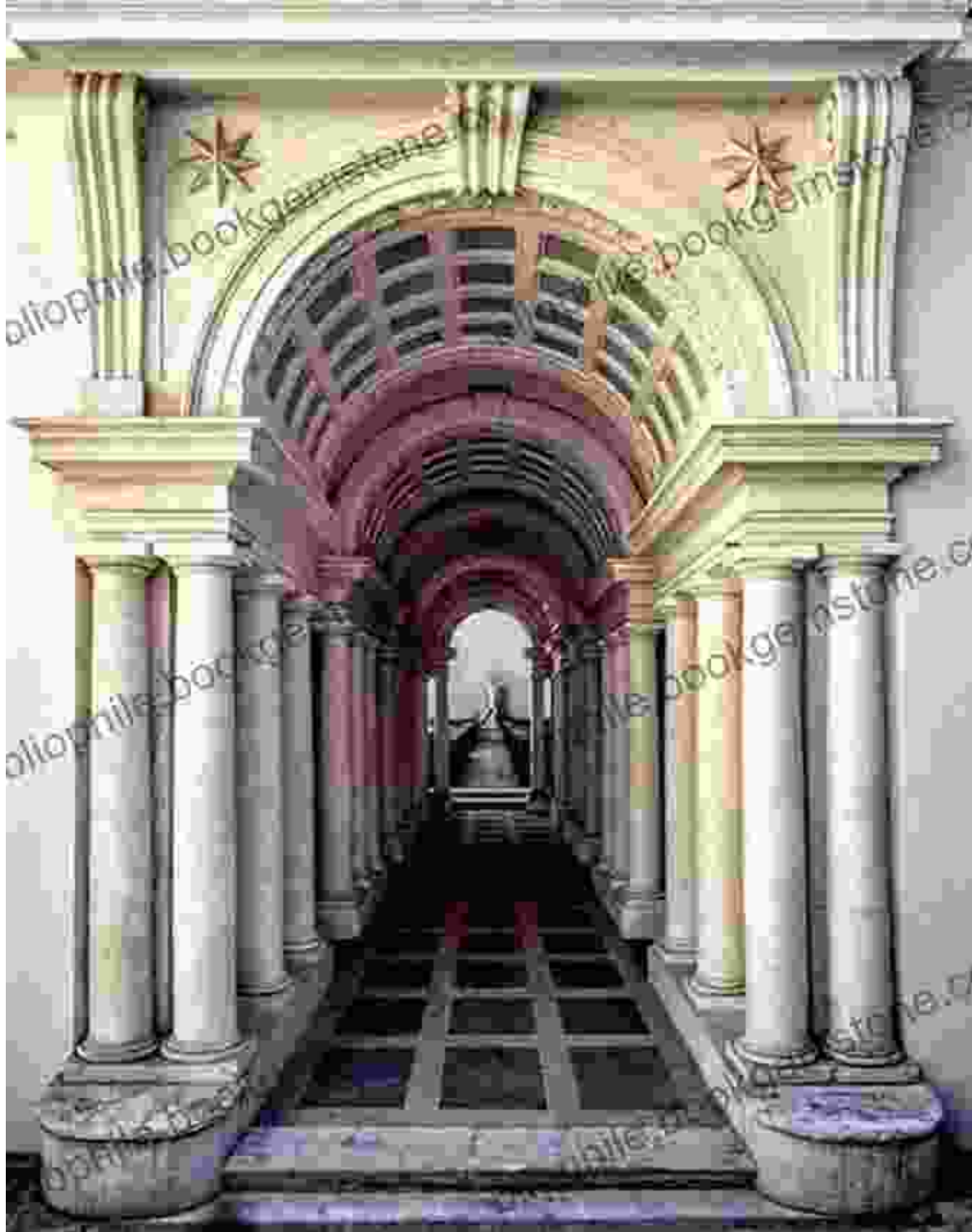
Palazzo Spada's famous forced perspective gallery

One of the most fascinating examples of the rivalry between Bernini and Borromini can be seen in the Palazzo Spada. Originally designed by Borromini, the palace features an ingenious optical illusion known as the "forced perspective" gallery.