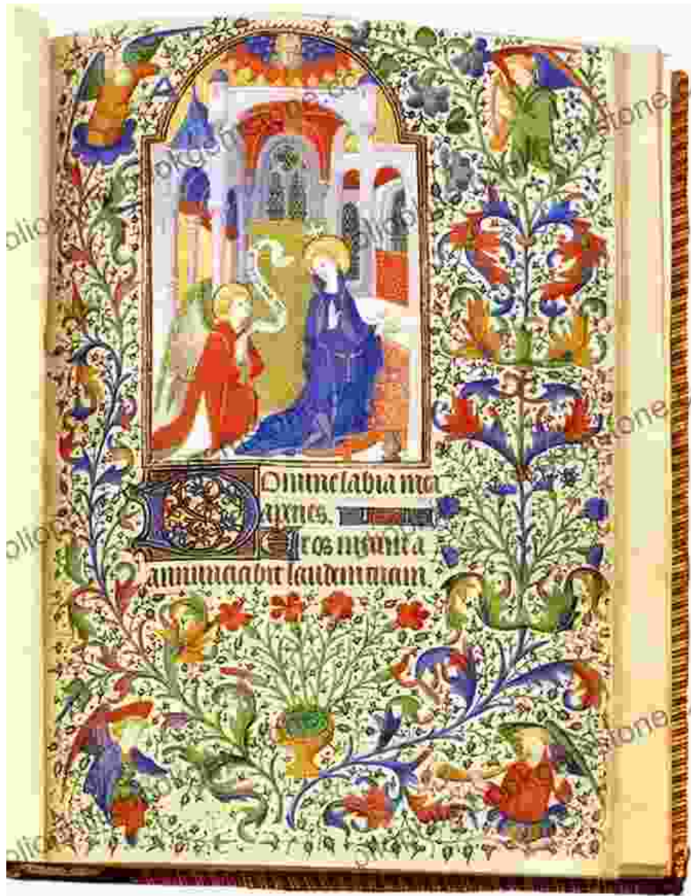
Illuminated manuscript page with intricate geometric patterns and stylized plant motifs