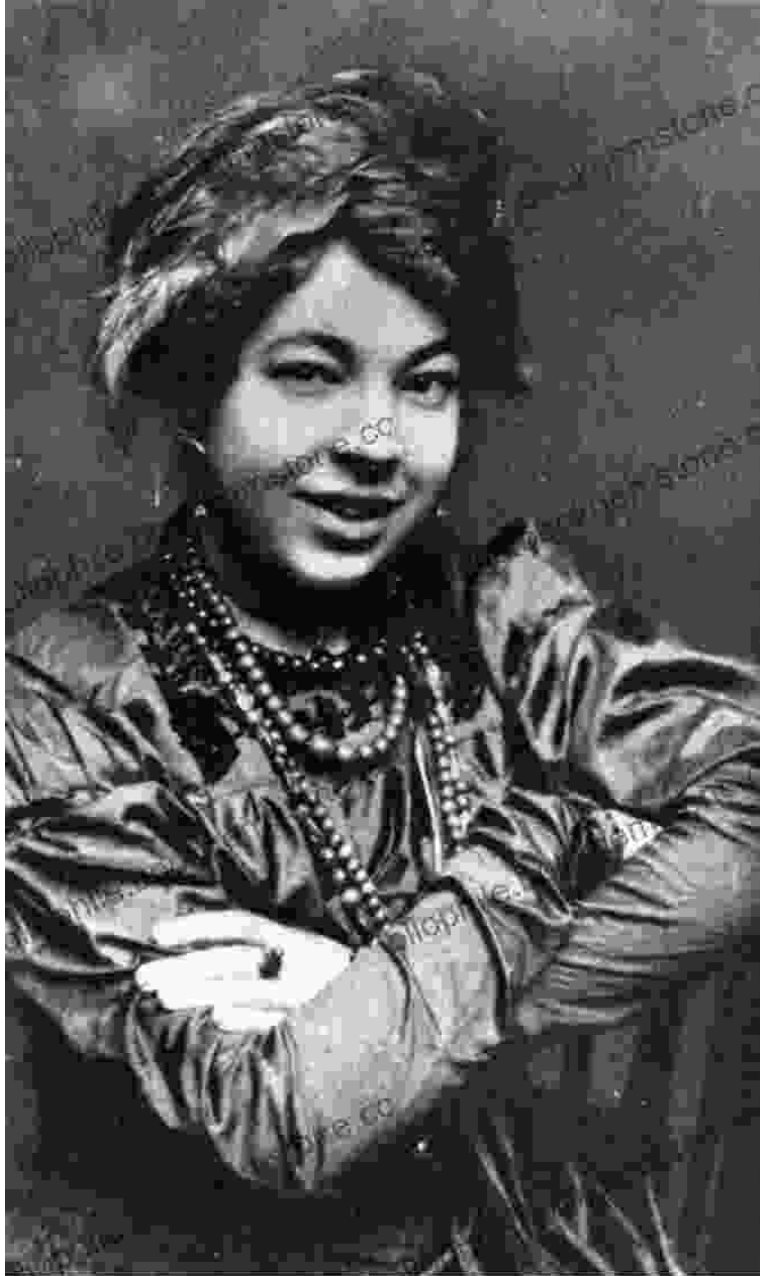
A self-portrait by Pamela Colman Smith, capturing her enigmatic and artistic spirit.

illustrations have left an enduring mark on popular culture, appearing in books, films, and other media. Moreover, Smith's work has played a significant role in the revival of interest in Celtic mythology and folklore.