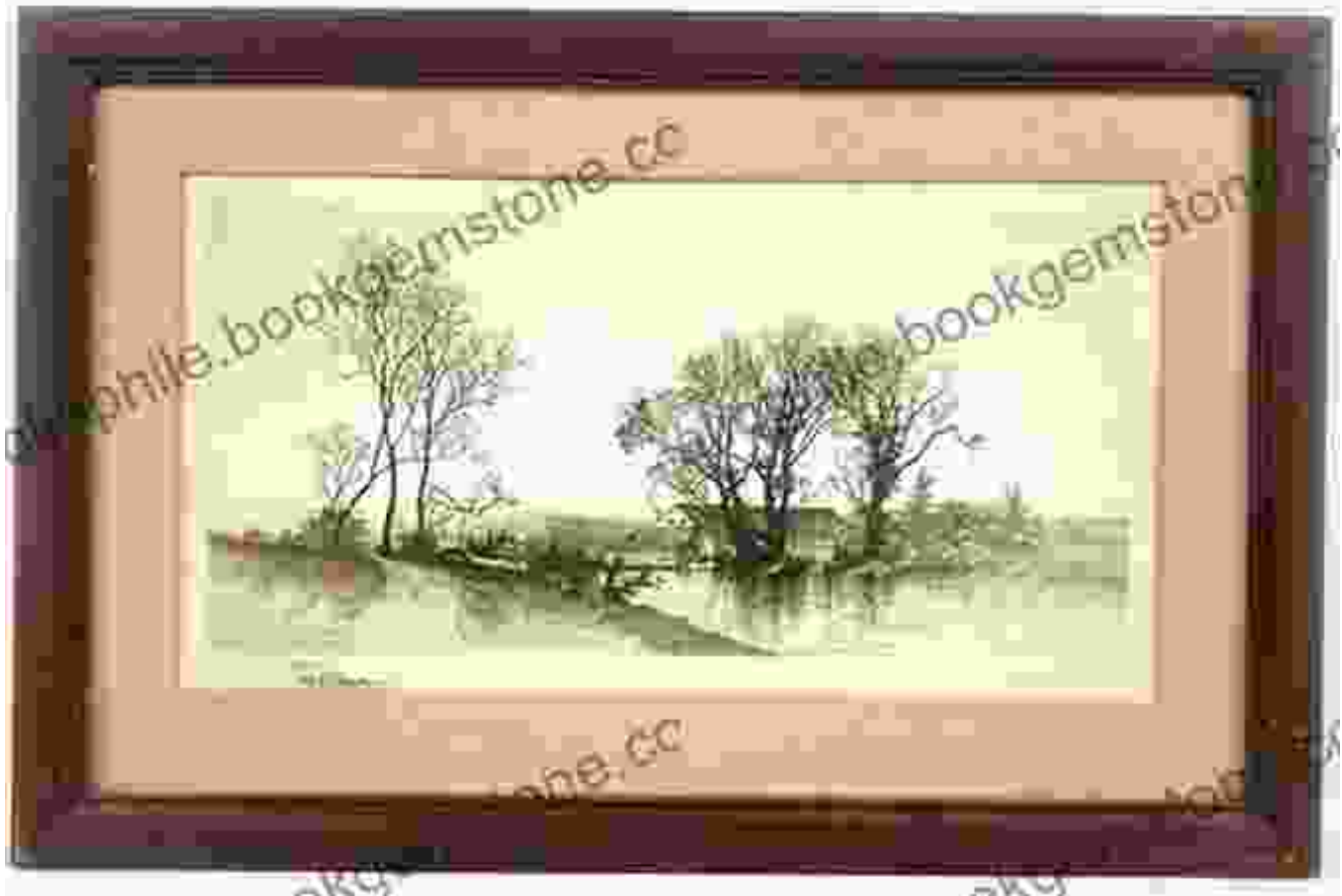
Etching print of a landscape