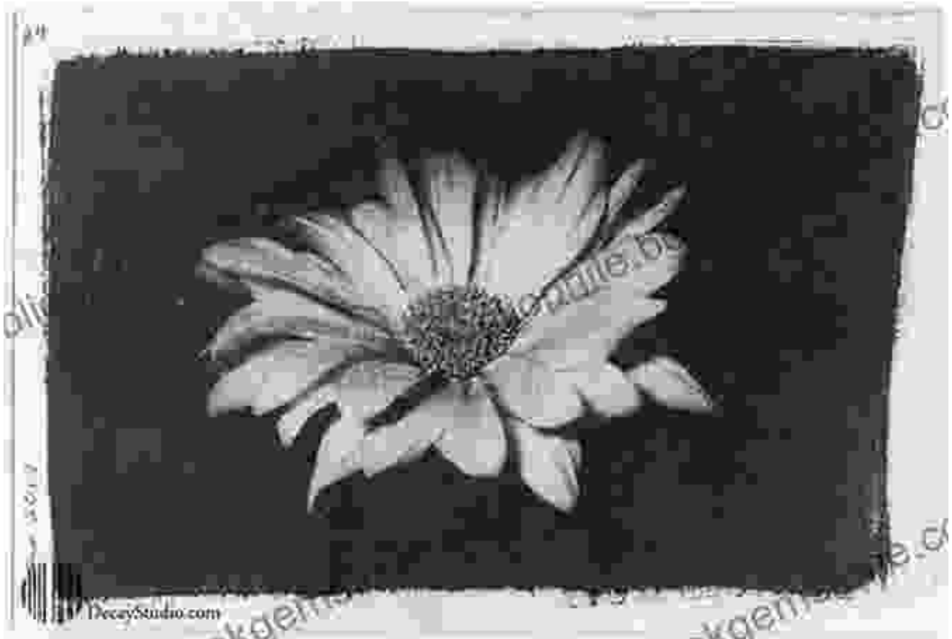
Gum bichromate print of a flower

Gum bichromate is a photographic printing process that uses a mixture of gum arabic, potassium bichromate, and pigment to create a print. The process involves coating paper with the photosensitive mixture, exposing it to ultraviolet light through a negative or the direct placement of objects, and then developing the print in water. This process allows for a wide range of tonal and color variations, resulting in unique and expressive images.