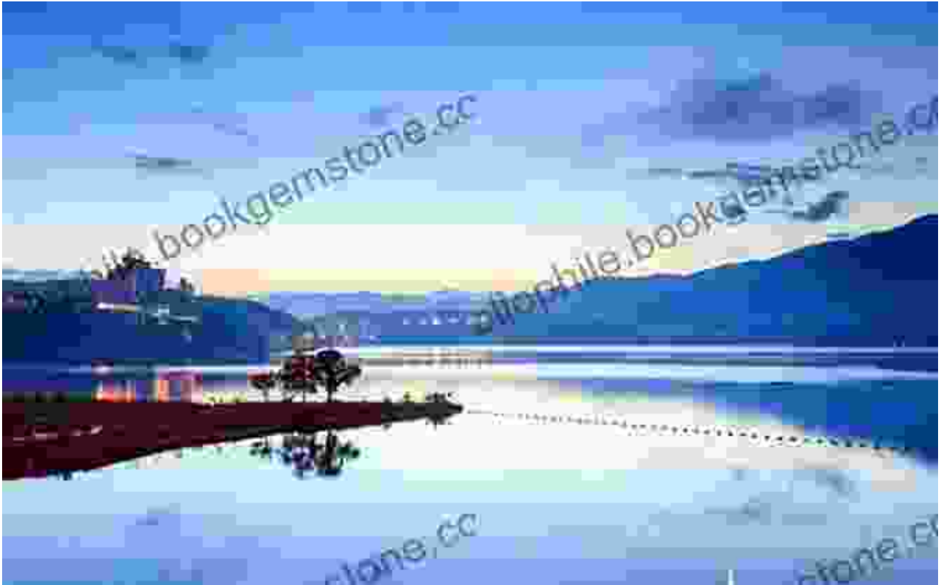
Sun Moon Lake in Taiwan