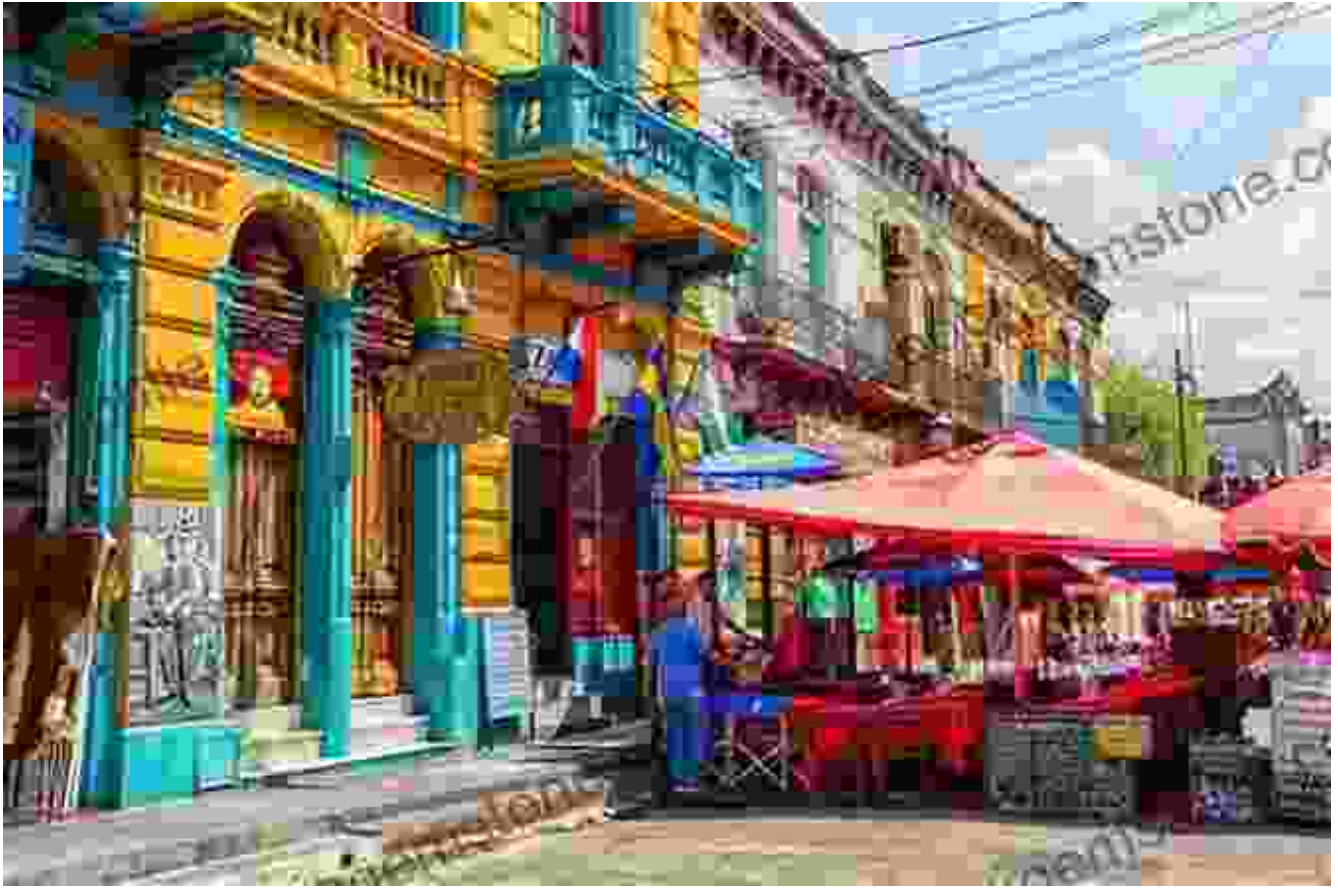
La Boca neighborhood