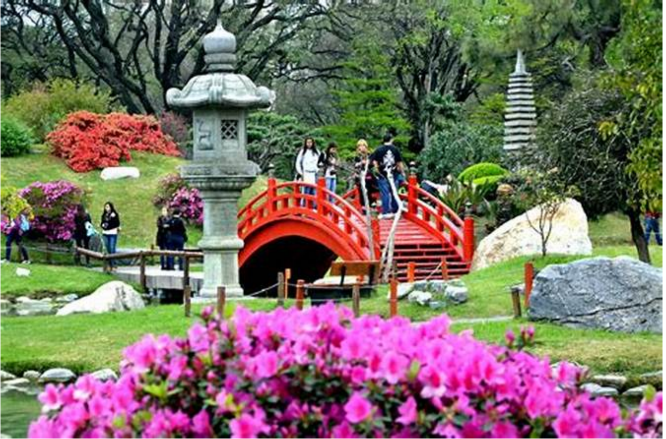
Jardín Japonés Japanese garden