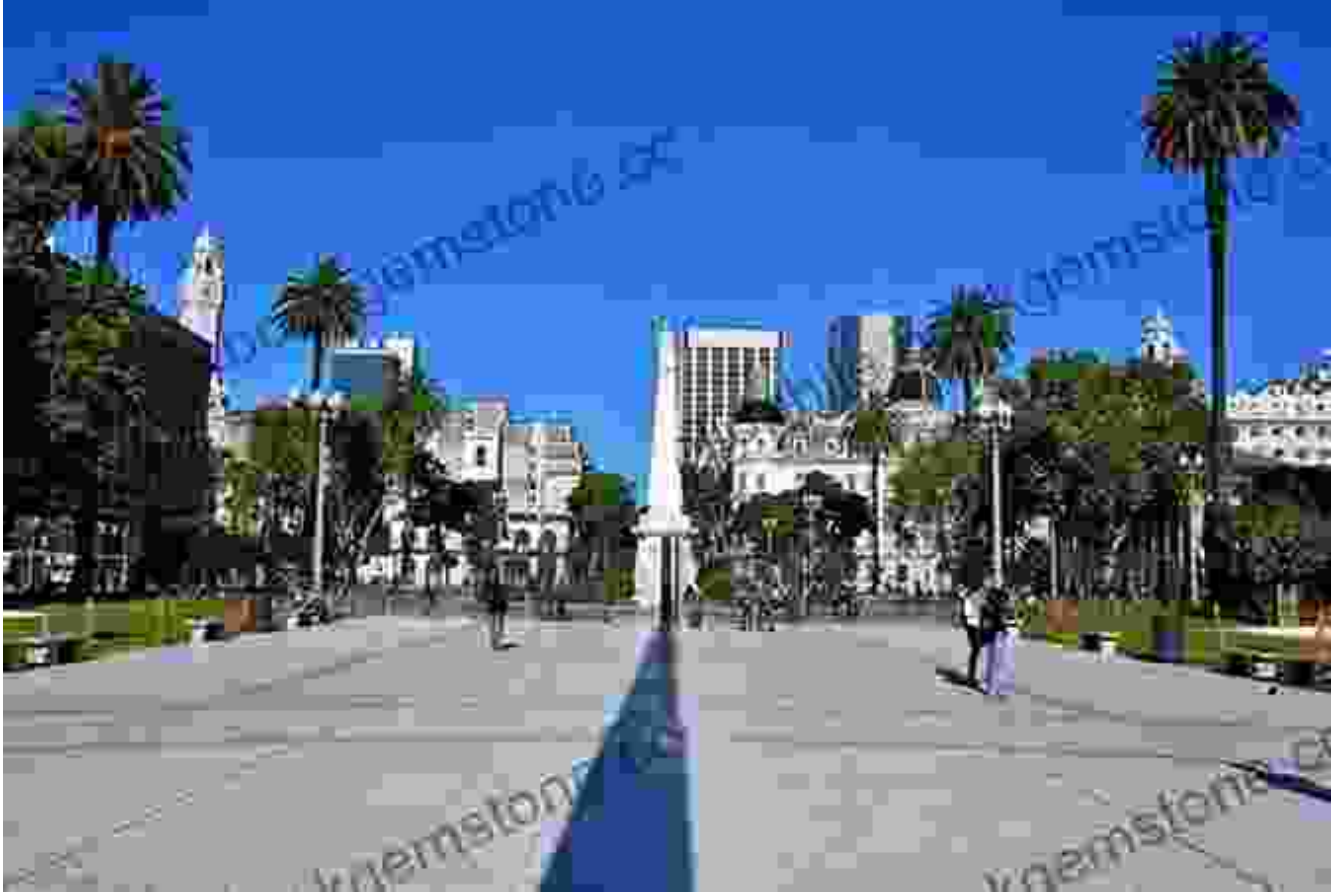
Plaza de Mayo square