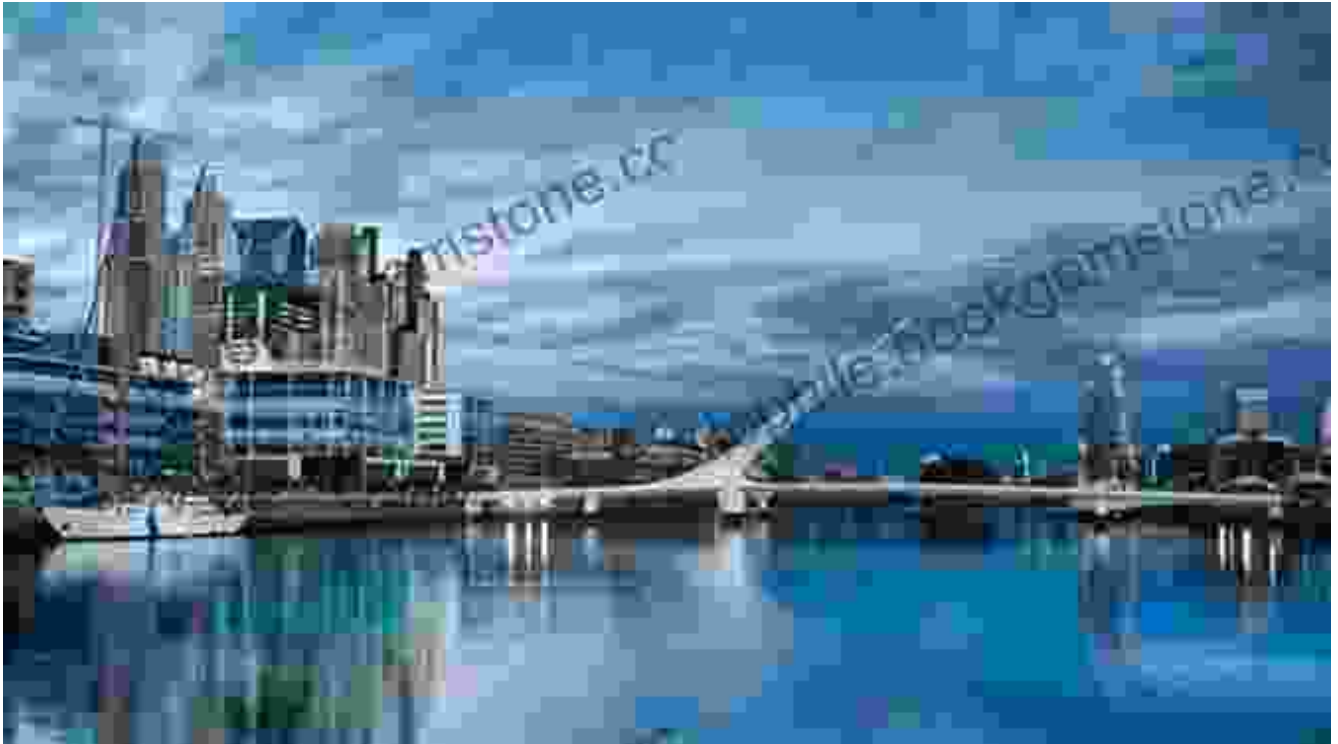
Puerto Madero neighborhood